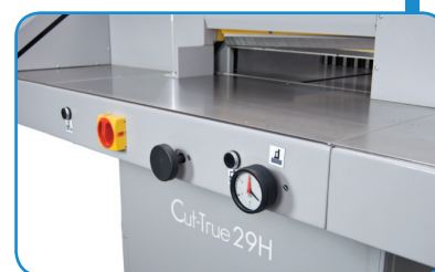
Two-button operation, fine-tune knob, adjustable hydraulic pressure gauge