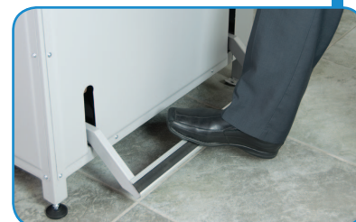
Foot pedal pre-clamp holds paper to check alignment prior to cutting