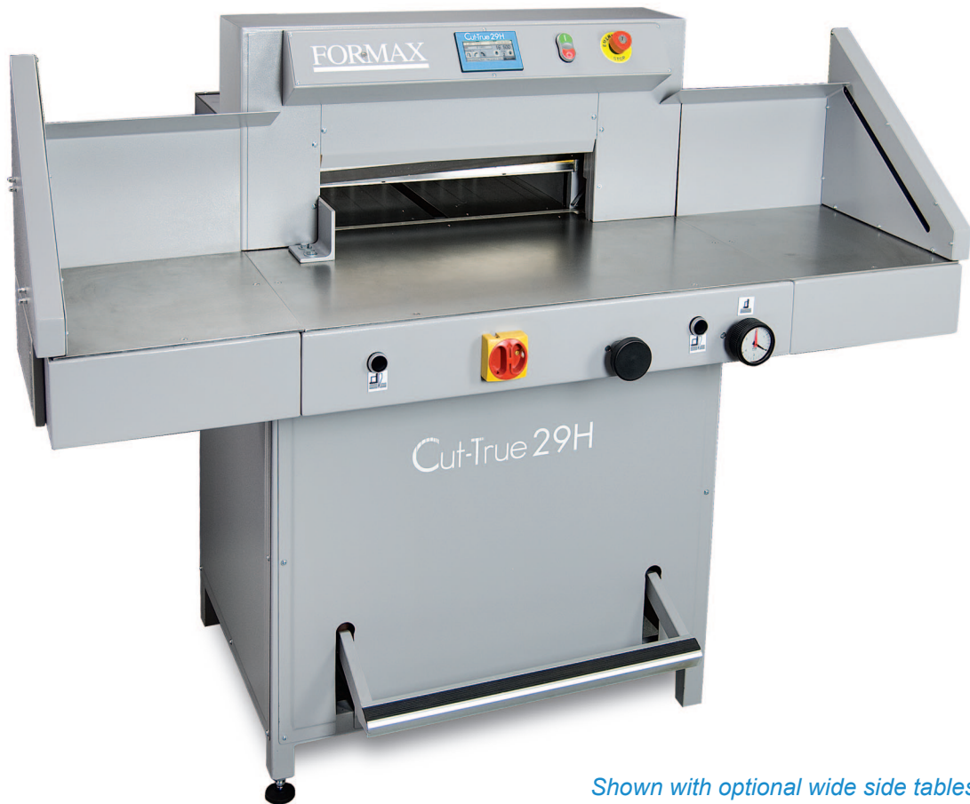
Shown with optional wide side tables

The Formax Cut-True 29H Hydraulic Guillotine Paper Cutter offers precision cutting for paper stacks up to 20.5" wide. User-friendly, intuitive features include a touchscreen control panel, automatically-adjusting back gauge and the capacity to program up to 100 jobs/100 cuts . An infrared light beam safety curtain provides safety and convenience as it shuts down operation if the light plane is interrupted.