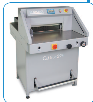
Standard model, without side tables

MyBinding.com 5500 NE Moore Court Hillsboro, OR 97124 Toll Free: 1-800-944-4573 Local: 503-640-5920